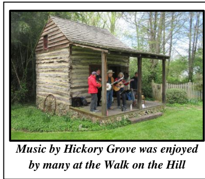
Music by Hickory Grove was enjoyed by many at the Walk on the Hill